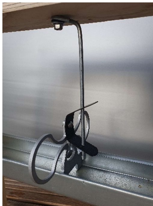
60S hanger connected to GK-profile and 4mm suspension wire

Labrys Oy / InfiniSpring Uuspihlajantie 19 66370 Närviöjoki Finland